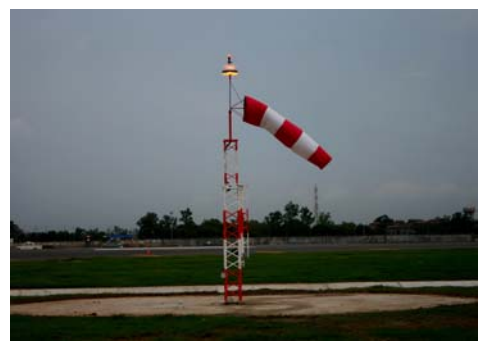
Exel Wind Cone Masts

Support structures for wind direction indicators, transmissometers and forward-scatter meters should be tested for frangibility in accordance with procedures for approach lighting towers.